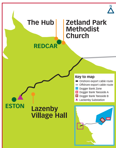
Map of the public consultation event venues.

Consultation responses can be submitted in person at the public events, by email, to our Freepost address or by calling Freephone 0800 975 5636.