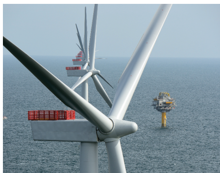
The proposals for Dogger Bank Creyke Beck comprise two offshore wind farms, up to 1.2 GW each

The acceptance of the application by the Planning Inspectorate represents the culmination of one of the most comprehensive and thorough environmental impact assessments ever undertaken by an offshore wind developer. This has been