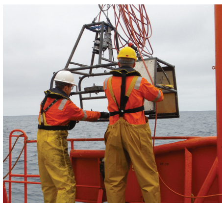
Previous offshore surveys have helped Forewind gain unparalleled data on the Dogger Bank Zone.

Since winning the rights to develop Dogger Bank in January 2010, Forewind has initiated