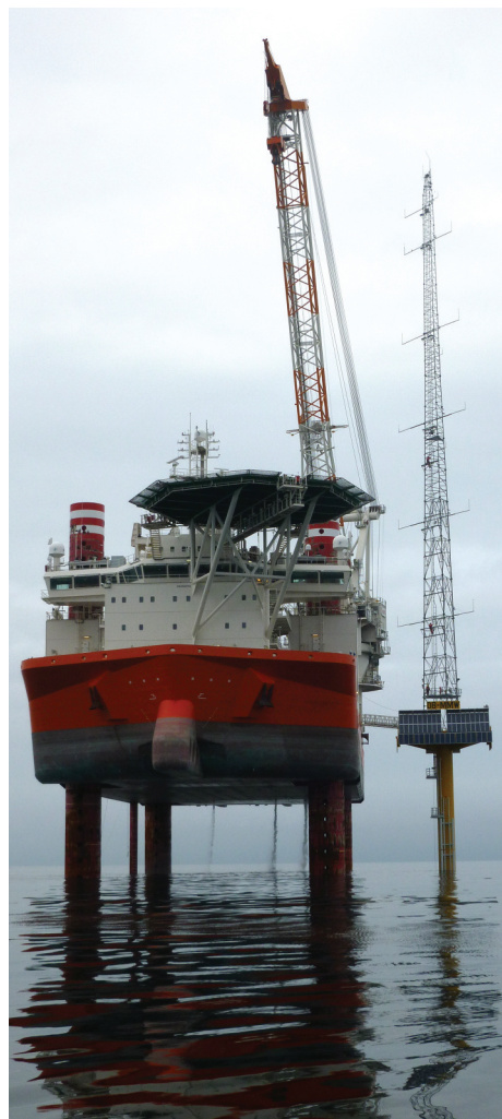
Brave Tern installs the second met mast on Dogger Bank.